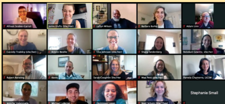
NASW-MA Board members, staff, and interns gathered virtually for our annual retreat

OUR MISSION: National Association of Social Workers Massachusetts Chapter is a membership association that advances professional social work practice throughout the Commonwealth and advocates for equity and justice for all people.