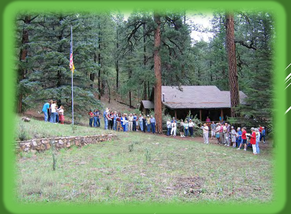
Holy Ghost Tract Flag Raising