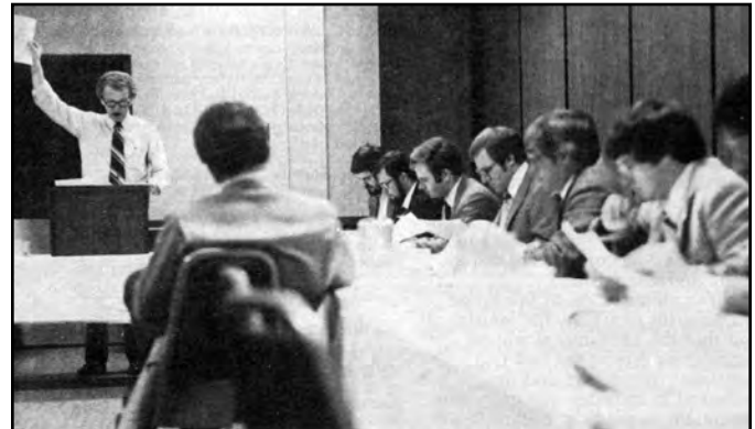
Historic photo of the NSBA Legislation Committee.