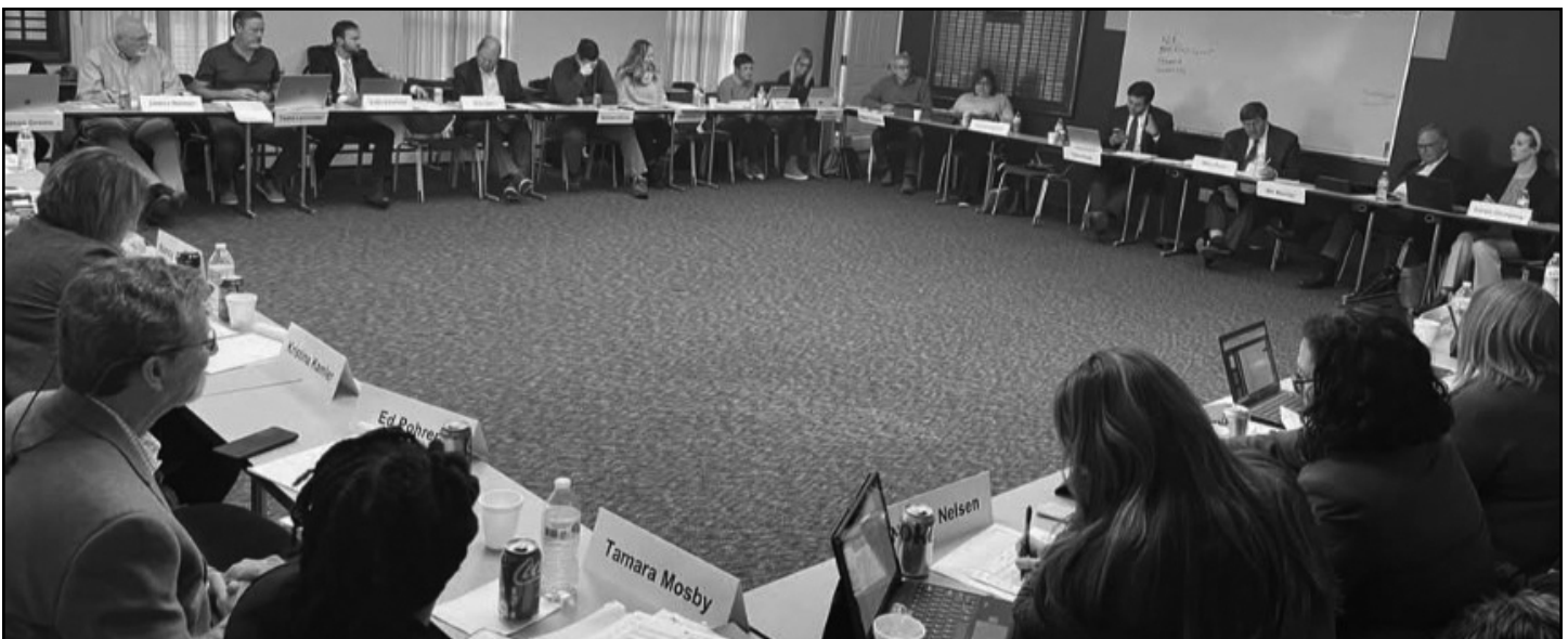
Members of the NSBA Legislative Committee in 2023.