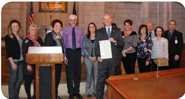
Governor Pete Ricketts proclaimed November 2015 as Hospice Month in Nebraska.

NHPCA provided educational hospice resources for patients and families through the “Hospice lets me be...” outreach campaign. The campaign focuses on real-life stories to promote hospice benefits, awareness, and connect people with resources. NHPCA distributed educational worksheets, videos, stories, and other outreach materials to member hospices across the state.