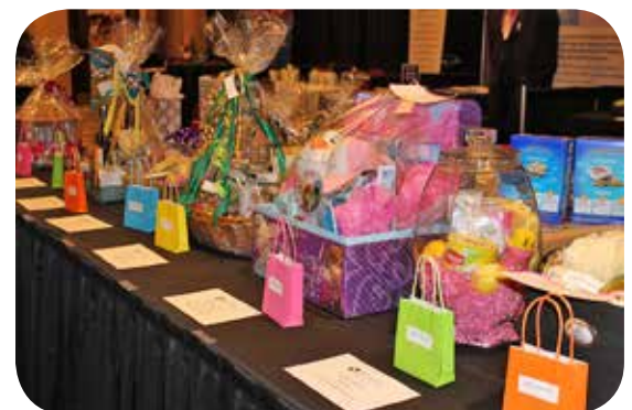
Proceeds from a raffle at NHPCA's 2015 annual conference benefit Nebraska's hospice and palliative care professionals.