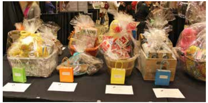
Proceeds from a raffle at NHPCA's 2016 annual conference benefit Nebraska's hospice and palliative care professionals.