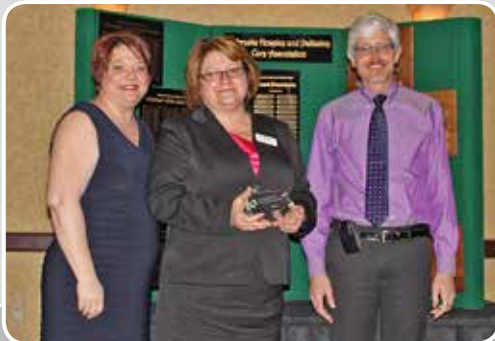
2013 State Impact Award KidGlov, Lincoln