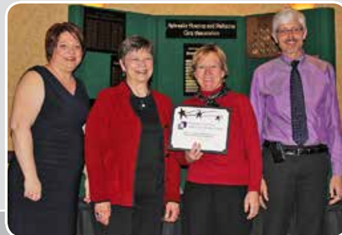
2013 Shining Star Award Children's Hospital and Medical Center Hand in Hand/Palliative Care, Omaha