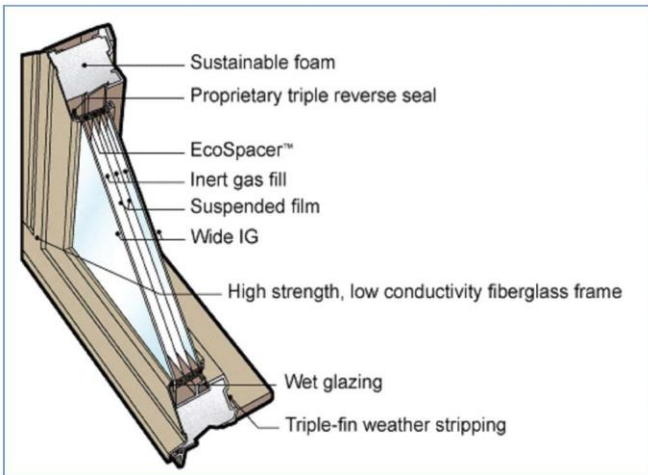
Figure 2. Cutaway of a quad pane window including the frame.

One advantage of this system is its well understood benefits (demonstrable via energy models) and its design and performance flexibility. Multiple layers and a broad library of low-e coatings allows for systems that can be tuned for low or high solar gain, tint and value in all of the forms and styles that architects are comfortable using. Other technologies to improve glazing thermal performance currently in research or undergoing initial market adoption include vacuum glass panes and evacuated insulated glass. These units may soon be widely available. As with many emerging technologies, the shortcomings of these new methods are that they are costly, difficult to fabricate across a range of typical dimensions, and are unproven over a typical 20 year service life. 6