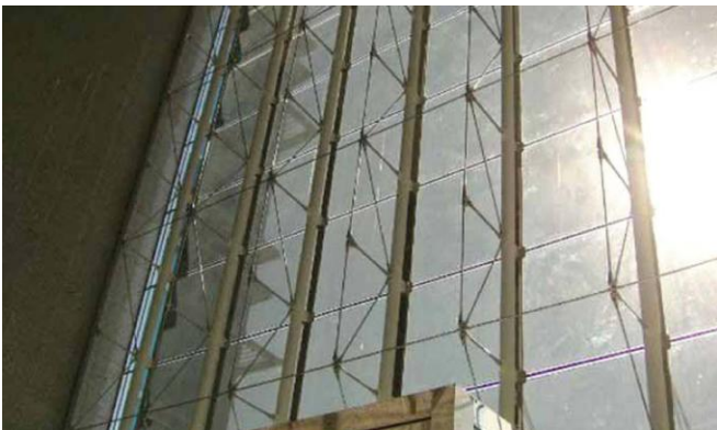
Figure 5. Image of a commercially available “see thru” BIPV product. Courtesy SunTech Corp.

Transparent BIPV systems are thin-film products that typically incorporate very thin layers of PV active material placed on a glass superstrate or a metal substrate using vacuum-deposition manufacturing techniques similar to those employed in the coating of architectural glass ( Figure 5 ).