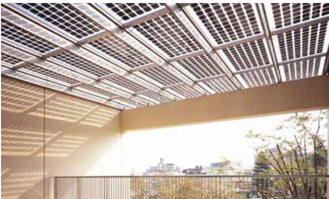
Figure 4. Image of a commercially available “light thru” BIPV product.

Third generation BIPV will come in two main forms: partially opaque/light transmitting; and transparent. As implemented today, light transmitting BIPV consists of solar cells made from thick crystalline silicon either as single or poly-crystalline wafers ( Figure 4 ). These deliver about 10 to 12 Watts per ft 2 of PV array (under full sun). Such technology is best suited for areas with no light transmission requirements (e.g. spandrels) or shading areas such as overhangs and sunshades.