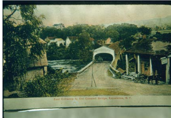
East Entrance to Old Covered Bridge, Esperance, N.Y.