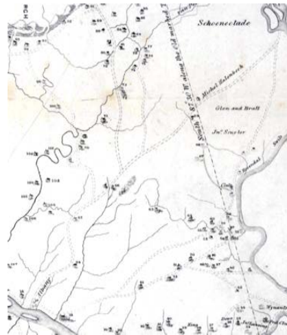
Portion of the Map of Rensselaerwyck 1767