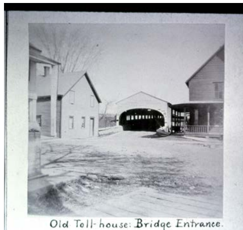
Old Toll-house: Bridge Entrance.