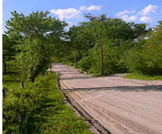
unimproved portion of the Albany Post Road in Phillipstown, NY