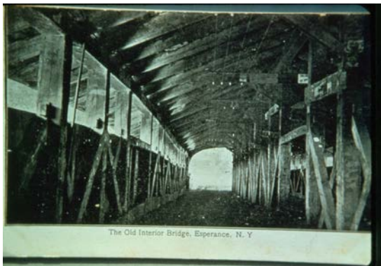
The Old Interior Bridge, Esperance, N. Y.