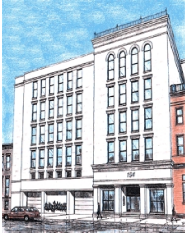
Architectural rendering of office building under renovation at 194 Washington Avenue, Albany

League of Women Voters and NYSDA Hearings on Public Defense, 7 Comments to the Committee to Promote Public Trust and Confidence in the Legal System, 9 Comments to the New York State Bar on a Proposed Fee Commission, 9 Gideon Coalition, 10