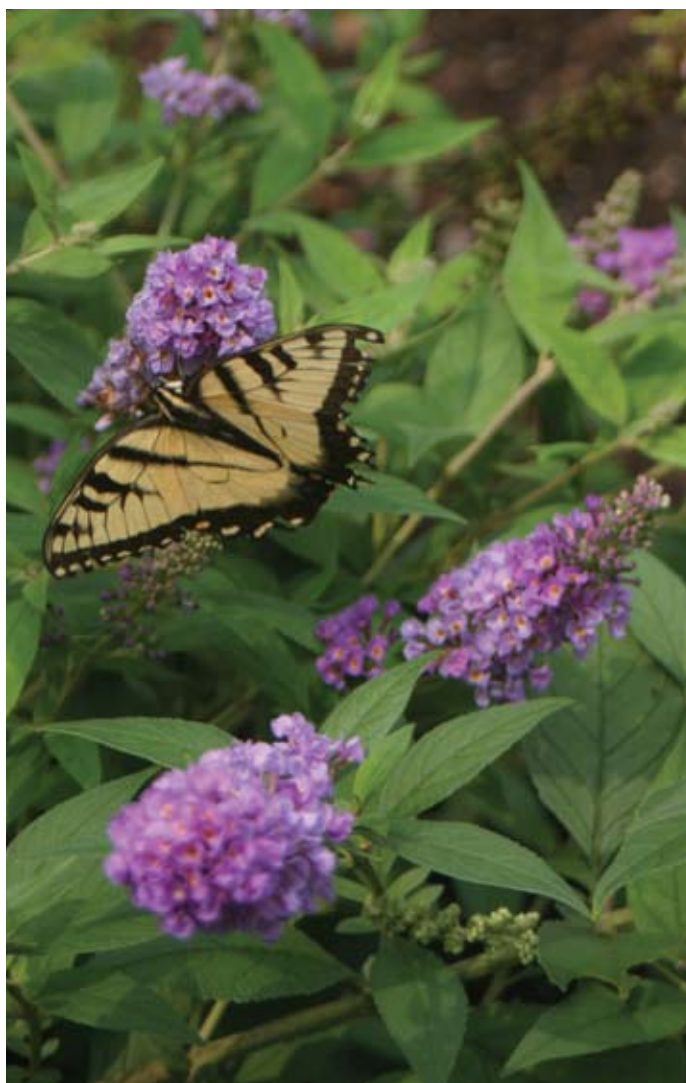
'Blue Chip' Lo & Behold® was found to have a 98.55 percent reduction in seed production compared to the mean of four other industry-standard cultivars. The reduced fertility of 'Blue Chip' comes from its complex pedigree, which is a common result of interspecific hybridization.