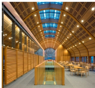
Yale’s Kroon Hall

Bottom Line: Timber architecture — in all shapes and sizes — is rising to exciting new heights. And as steel and concrete gradually fall to the wayside due to their steep environmental costs, engineering Glulam into a building can produce a lighter weight structure with a lesser carbon footprint.” (Information source: architizer.com )