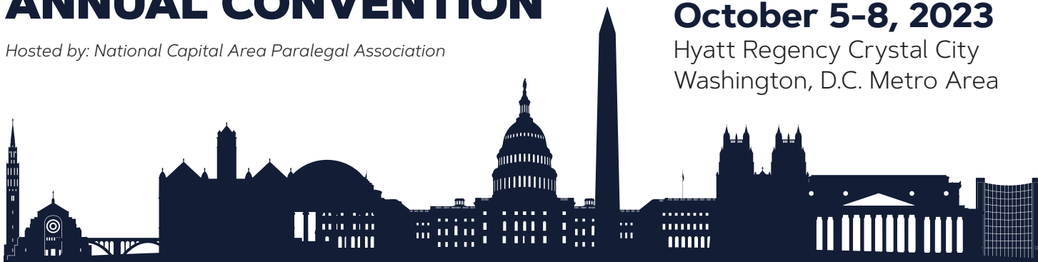
EXHIBIT AT CONVENTION

Hyatt Regency Crystal City Washington, D.C. Metro Area