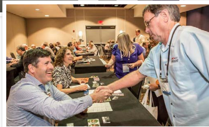
Speed Networking at 2017 P2P Summit