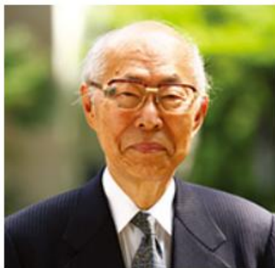
Dr. Akito Arima

“Recent Progress in iPS Cell Research and Application”