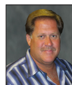
Greg Power Hoffman's Chocolates Greenacres, FL