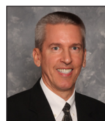
Chuck Castle Tap Packaging Solutions Grayson, GA