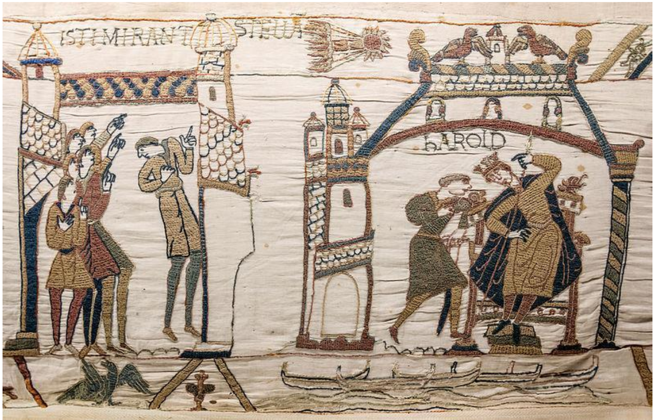
Slide 1.3 F

Which time period is it (Classical, Medieval or Renaissance) and why?