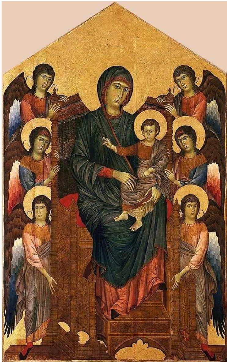
Slide 1.3 D

Which time period is it (Classical, Medieval or Renaissance) and why?