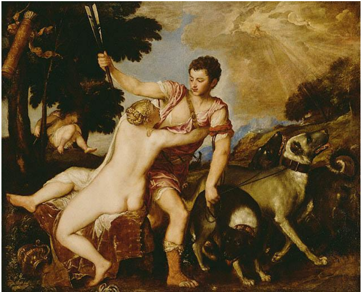
Slide 1.3 C

Which time period is it (Classical, Medieval or Renaissance) and why?