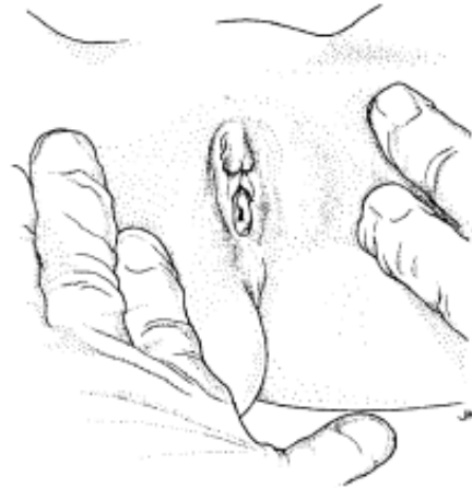
Supine Labial Separation