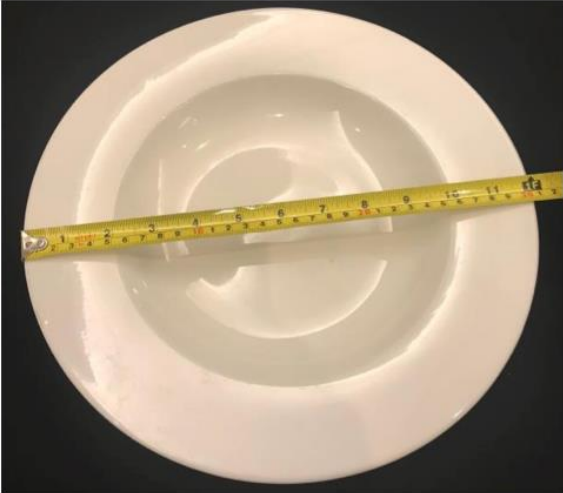
12" pasta/soup bowl