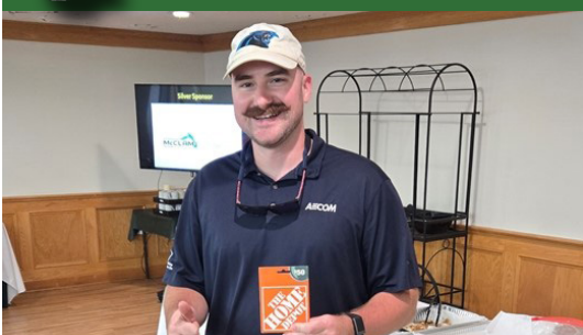
(played with Black & Veatch team)