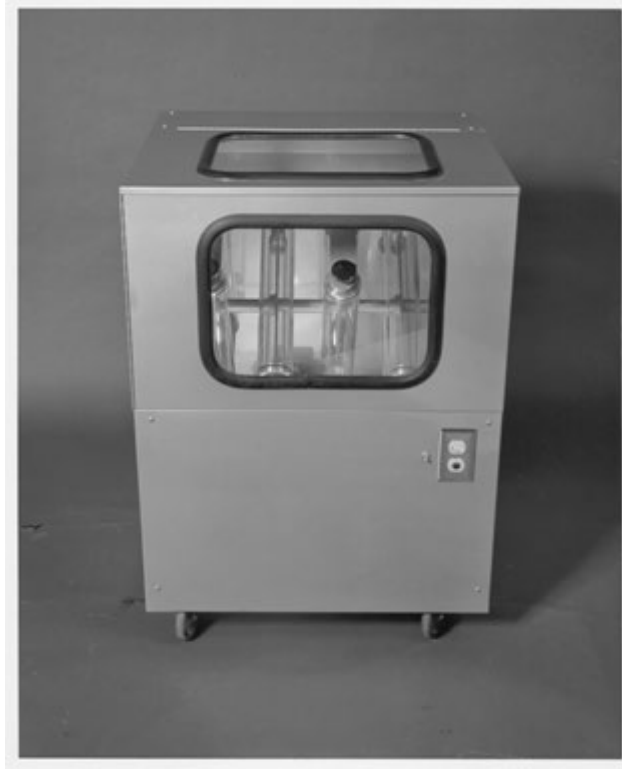
ABRASION MACHINE - CLOSED