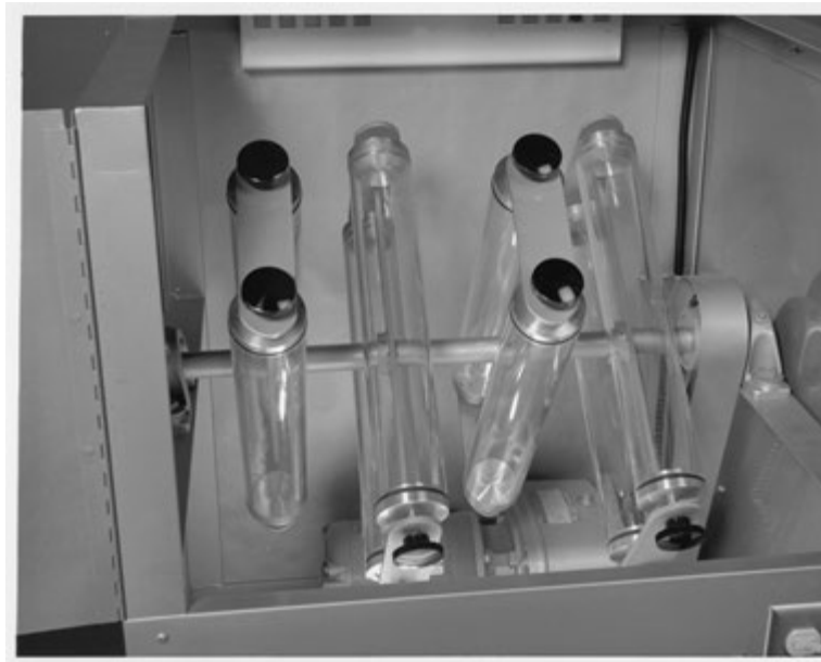
SHUTTLE CYLINDER ASSEMBLY