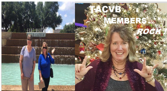
TACVB Staff Traveling to Annual Conference

Growing Member Relationships & Partnerships