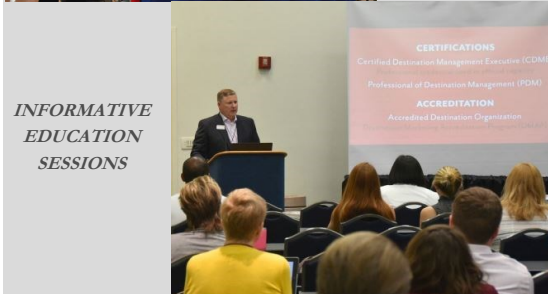
INFORMATIVE EDUCATION SESSIONS