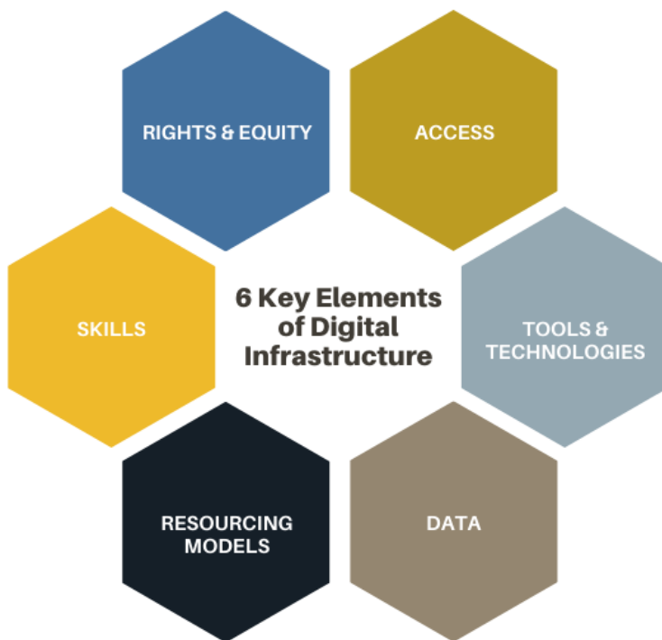
Figure 2: Download the framework at TAGtaskforce.org