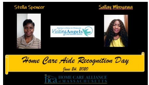
Screenshots from our Home Care Aide Recognition Day Campaign