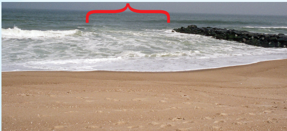
Rip currents often form near coastal structures.