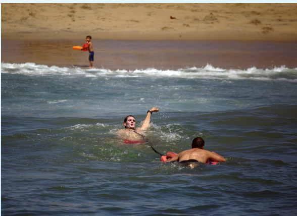
A lifeguard rescues a swimmer caught in a rip current.