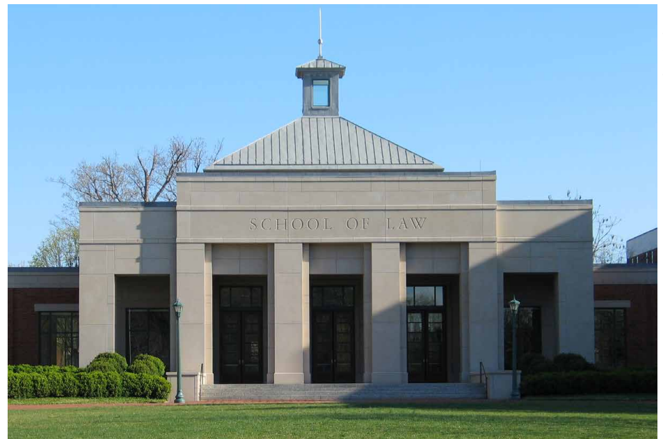
The University of Virginia School of Law