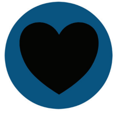
OPEN TO PUBLIC