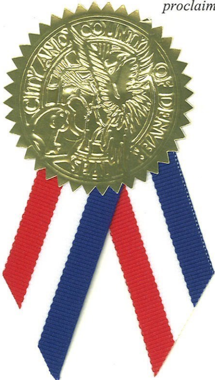
MICHAEL B. HANCOCK MAYOR

IN WITNESS WHEREOF, I have hereunto set my hand and caused the official seal of the City and County of Denver to be affixed this 30 th day of November, 2019