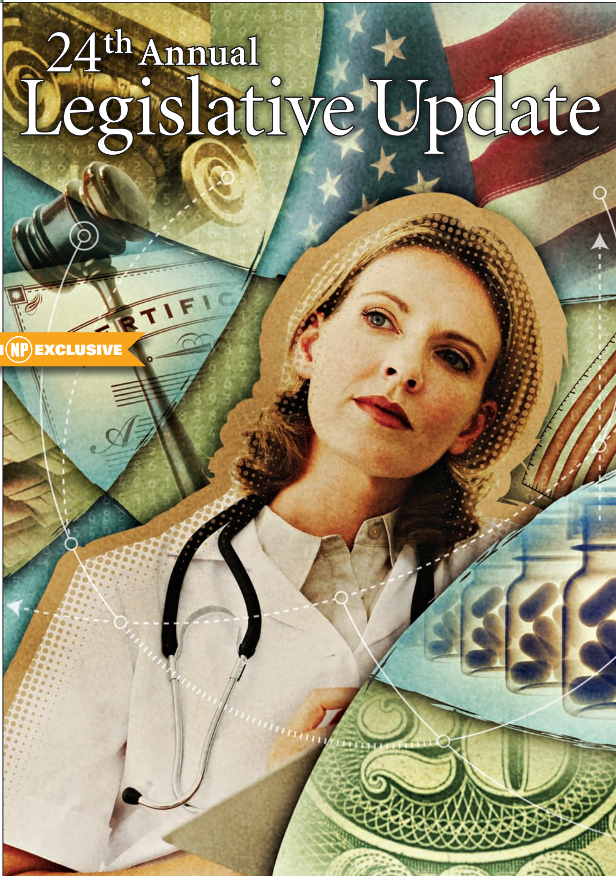
Illustration © Tom White/ 9 Surf Studios