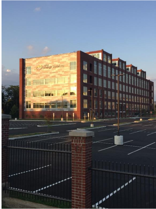
Photo: The recently renovated UGI Energy Services corporate headquarters.

Following the informative discussion, a tour of the recently completed UGI Energy Services office headquarters took place. The UGI facility is in what some may remember as the “Blue Building”, which is one of the original Berkshire Knitting Mills buildings that dates to the early 1900s. The event concluded with a networking event at the newly opened Sly Fox Tap House also located in one of the newly renovated buildings. Attendees enjoyed craft beer, cocktails, and appetizers. Despite rainy weather, over 50 BCONE and AIPG members attended the event along with additional guests. We hope this is the first of many collaborative events with our friends at BCONE.